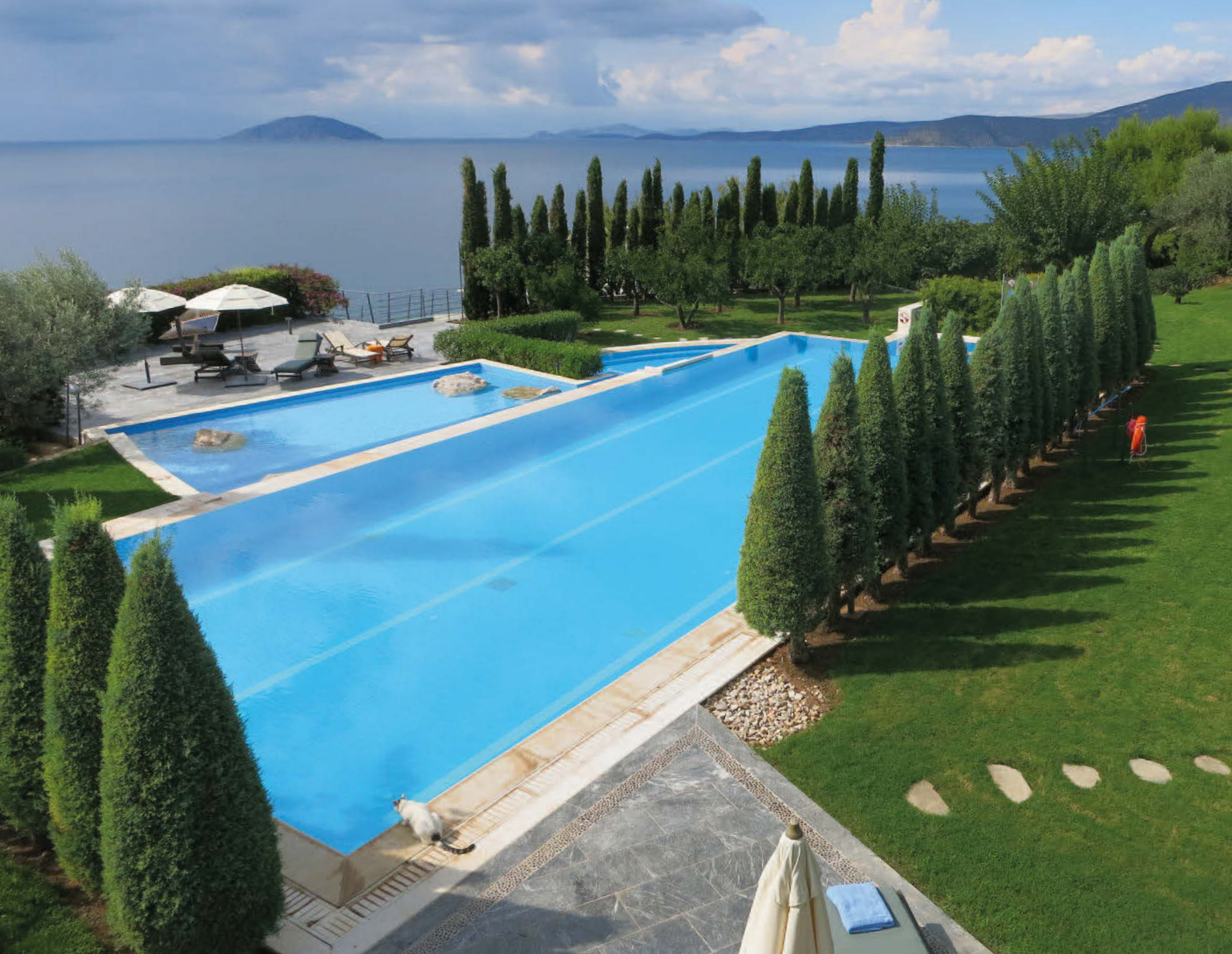
Sea View Villa

For more detailed information & photos visit www.gicthevillacollection.com